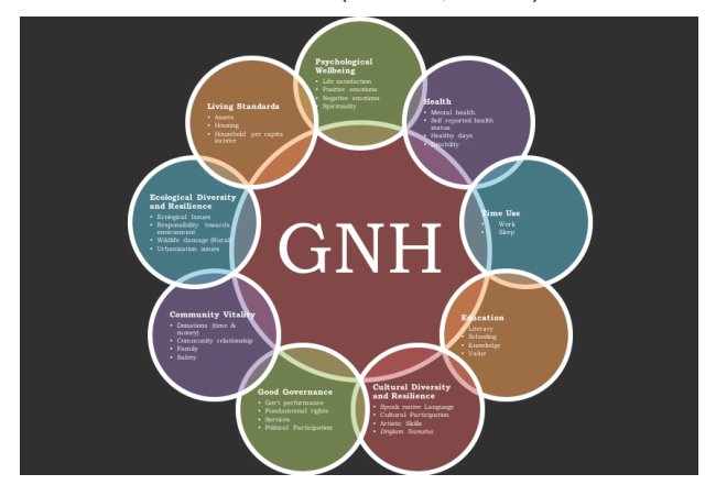
Figure 2 . The 9 Domains and 33 Indicators of the GNH Index Source : Karma Ura et al., 2012a

domains encompassing iv) time use, v) good governance and vi) ecological diversity and resilience, and innovative domains including vii) psychological wellbeing, viii) community vitality and ix) cultural diversity and resilience (Verma & Karma Ura. 2017). In the GNH Index, happiness is assessed through the nine domains, which in turn are elaborated through 33 clustered indicators that inform numerous survey questions (see Figure 2). The indicators reflect relevant aspects of life in a holistic way that is vital to the concept and practice of GNH (Karma Ura et al., 2012a). GNH seeks to convey more fully the breadth and texture of people's lives than the standard welfare measure of GDP per capita, and other dominant indices used in the West such as Human Development Index (HDI) (Karma Ura et al., in press, 2012a; Metz, 2014). It is operationalized in important and innovative ways that help to track GNH progress through time and determine GNH policies (Karma Ura et al., 2012a). Most relevant to this paper, GNH has been operationalized into indicators of measurement, and therefore responds to the interest of the development community for the engagement of new, non-monetary indicators (including subjective indicators) to assess development in terms of holistic social, cultural and environmental values (O'Neill, 2012).