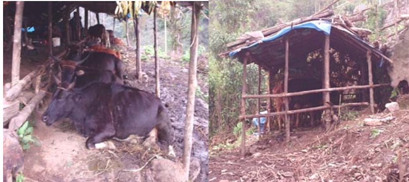
Fig. 2 Temporary housing of cattle at the village farms Breeding management

Most farms (67 percent) had temporary housing for adult cattle and calves made of wooden poles, singles (crudely-made planks) with bamboo mat and plastic sheet for roofing. Sixteen percent had semi-permanent houses made of roughly finished timber, with stone or plank flooring. Rooves were made of bamboo mat or banana leaf, which were invariably covered with plastic sheet (Fig. 2). The external plastic sheets were clamped with poles, tree branches and stones. Seventeen percent of farms did not have housing for adult cattle but had temporary sheds for calves.